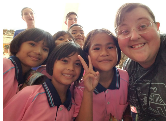
Aren't these kids adorable? This was a regular occurrence at any of the schools we visited!

As a lot of you know I'm volunteering here at Global Ventures everyday to help with IT. We have accomplished a lot of great things that keep the ministry running efficiently - One of the my favorites is the new GV App that I recently finished! You can text GVAPP to 77977 to download it or find it in the App Store or Google Play Store to check out what I've been working on :)