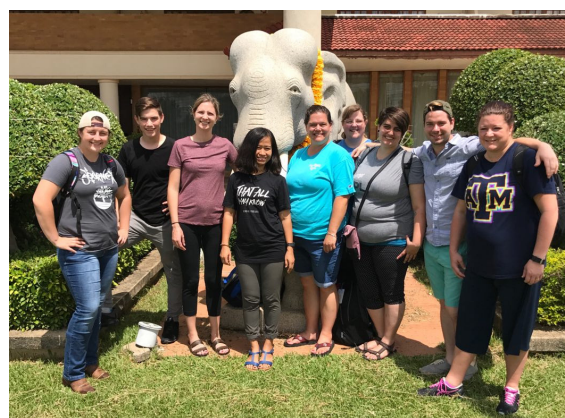
This was my team for the week. Most of them were Texans but I've learned to forgive that.